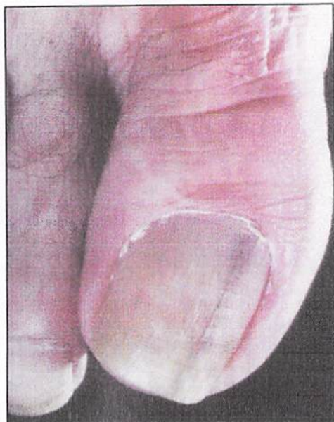
Figure 3: Malignant melanoma. There is a large melanonychia striata that is wider at its base, a good indicator of rapid growth.

bottom half, post-operative dystrophy is less likely.